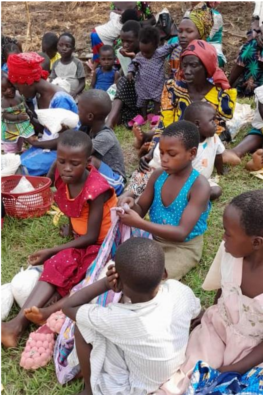
Food distribution by HEM in Kyaka II Refugee Settlement