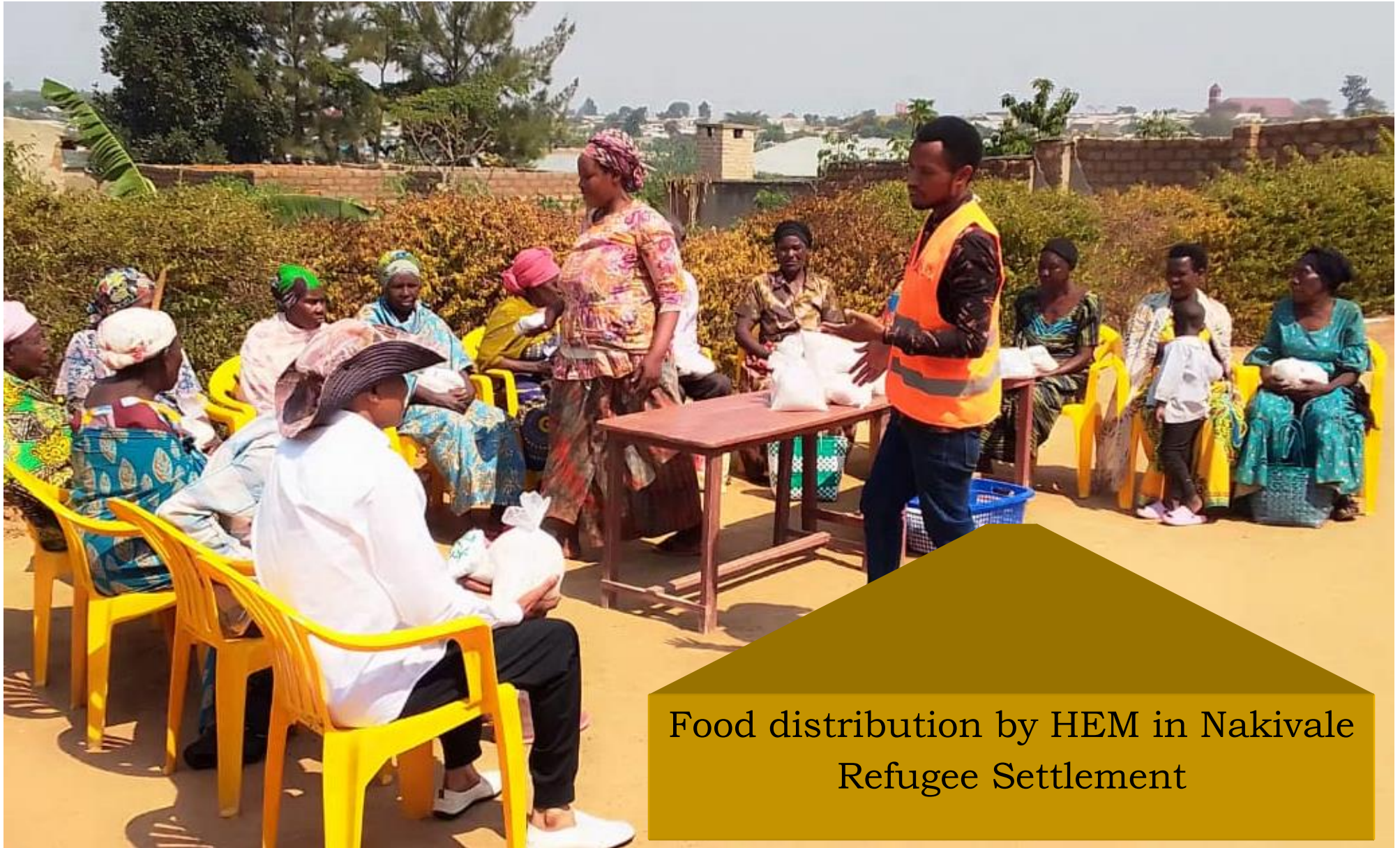
Food distribution by HEM in Nakivale Refugee Settlement